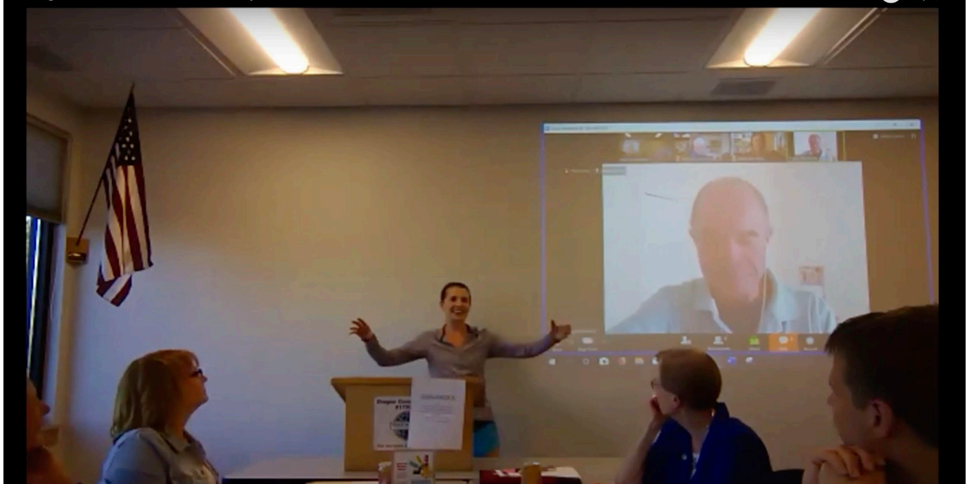
Oregon Communicators Open House - 2019 June 13